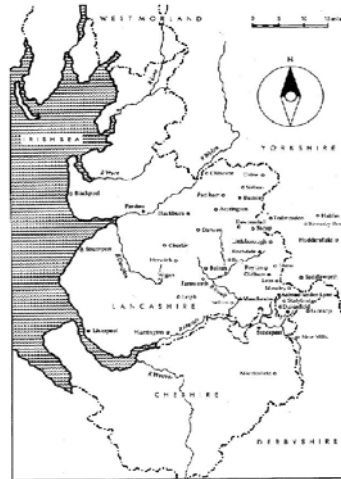
1 The cotton towns of North-West England