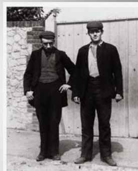
Jack London and Bert, a cobbler, ready to go hopping (1902).

Jack London, The People of the Abyss , 14.