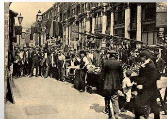
A view of Petticoat Lane

No sooner was I out on the street than I was impressed by the difference in status effected by my clothes. All servility vanished from the demeanor of the common people with whom I came in contact. Presto! In the twinkling of an eye, so to say, I had become one of them. My frayed and out-at-elbow jacket was the badge and advertisement of my class, which was their class. It made me of like kind, and in place of the fawning and too-respectful attention I had hitherto received, I now shared with them a comradeship. The man in corduroy and dirty neckerchief no longer addressed me as 'sir' or 'governor'. It was 'mate' now – and a fine and hearty word, with a tingle to it, and a warmth and gladness, which the other term does not possess.