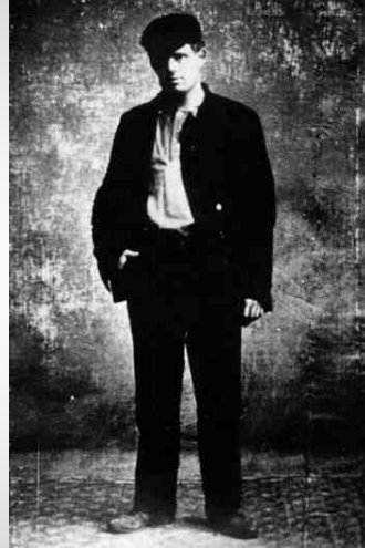
Jack London in the East End (1902)