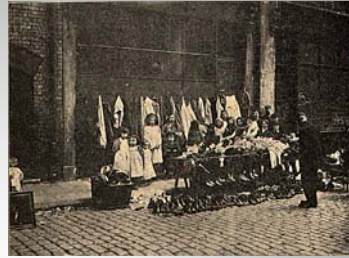
A shop where old clothes are sold

Jack London, The People of the Abyss , 13.